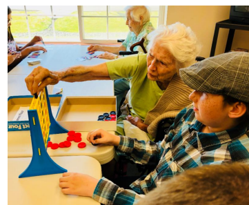
Games at the Cheney Care Center