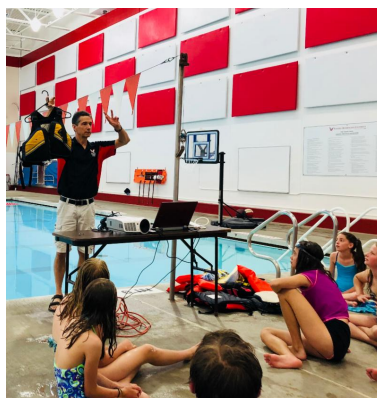
Swimming Safety at EWU